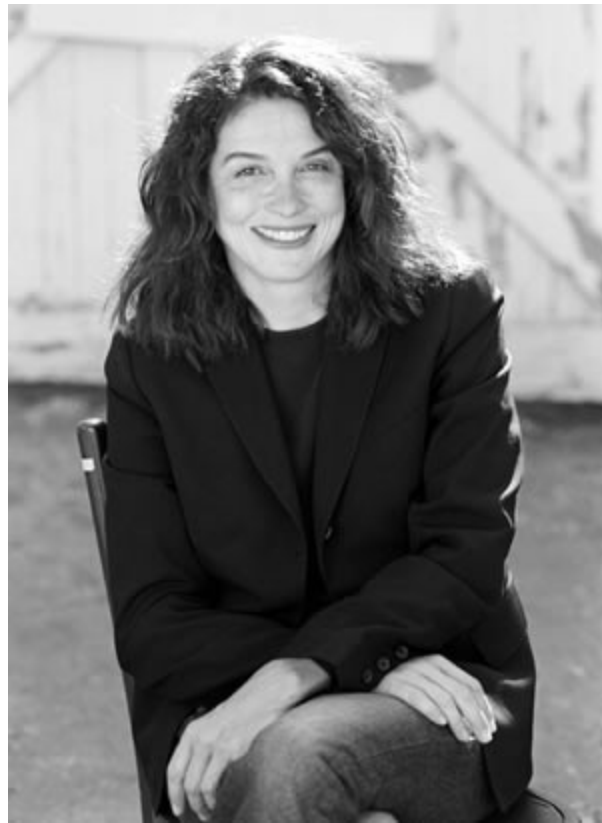
Melanie Mayron the Director of Slap Her She's French